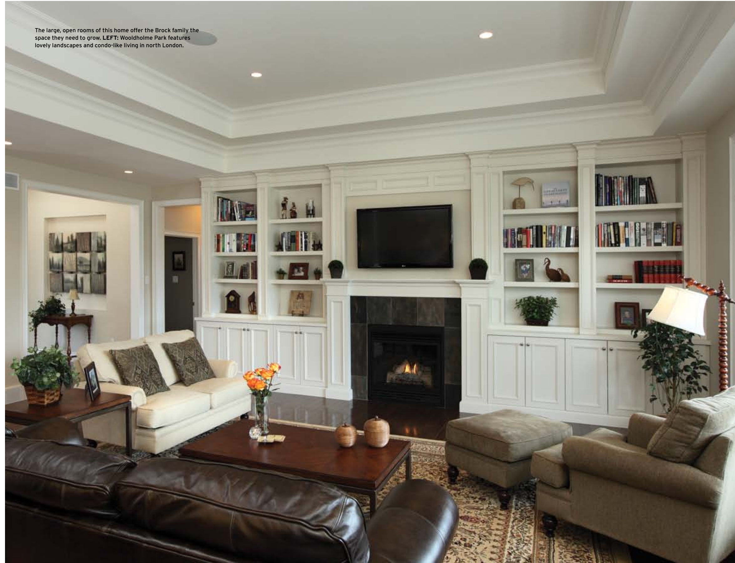
The large, open rooms of this home offer the Brock family the space they need to grow. LEFT: Woodholme Park features lovely landscapes and condo-like living in north London.