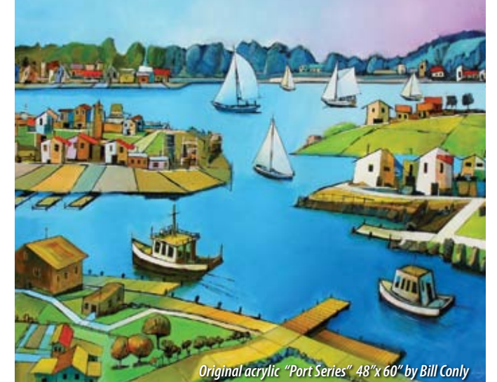
Original acrylic "Port Series" 48"x 60" by Bill Conly

originals | prints | custom picture framing