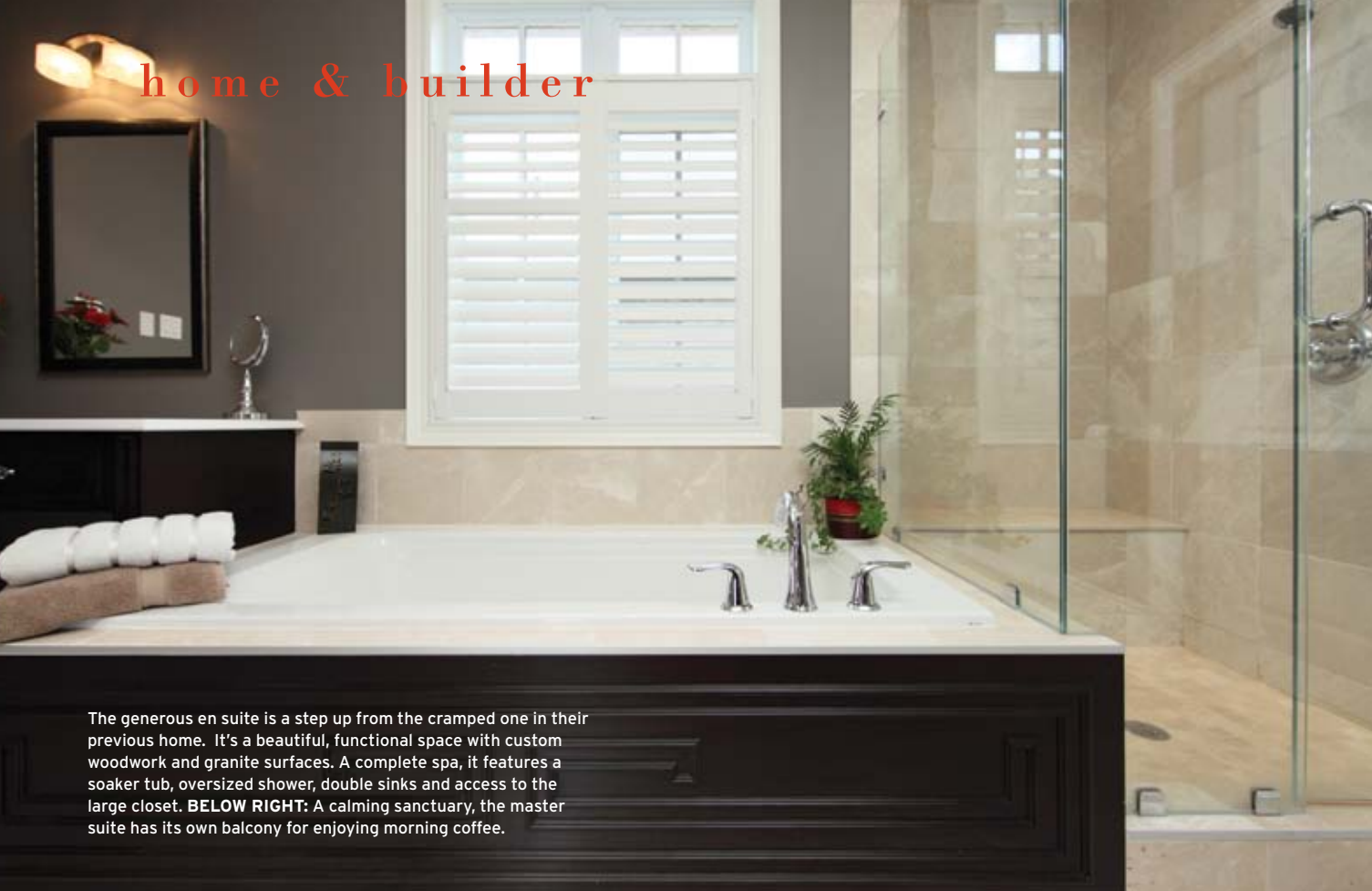
The generous en suite is a step up from the cramped one in their previous home. It's a beautiful, functional space with custom woodwork and granite surfaces. A complete spa, it features a soaker tub, oversized shower, double sinks and access to the large closet. BELOW RIGHT: A calming sanctuary, the master suite has its own balcony for enjoying morning coffee.