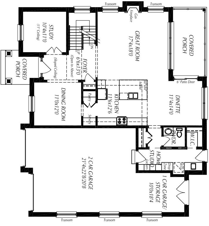
MAIN FLOOR PLAN 1428 sq ft